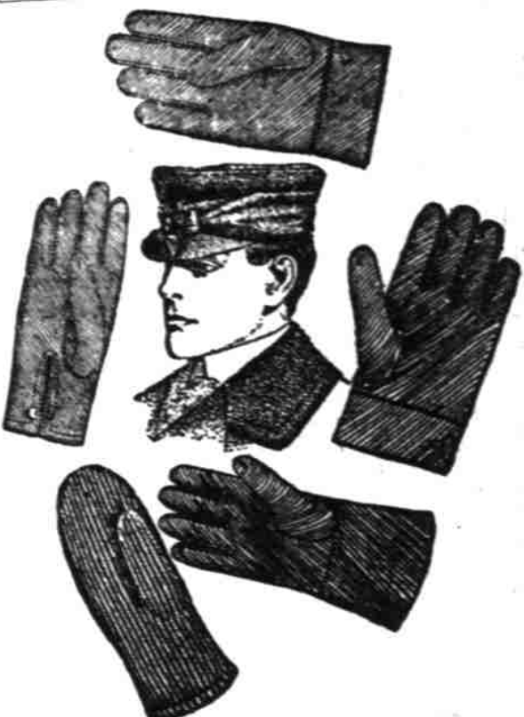
Greatest Bargains in Gloves, 25 to 98c

Children's Soft Shoes 23c. Children's $1.00 School Shoes 75c. $1.50 Shoes in Ladies and Misses', $1.19. $3.00 Patent Leather Shoes $2.39. See the new styles of Crawford Shoes for Men and Dolly Madison Shoes for Ladies.