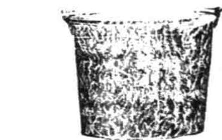
50c Enameled and Fibre Buckets 37c.