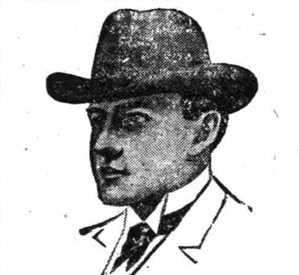
$1.50 Hats, black and colors, this sale, 98c. $2.50 Soft and Stiff Hats, this sale, $1.98.