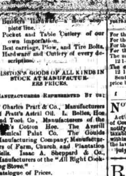
Please write for Illustrated Catalogue of Prices.

JULIUS LEWIS & CO., FISHER BUILDING, Have in stock, and offer to the trade at Bottom prices: