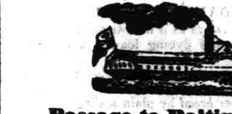
Passage to Baltimore.

NEW FALL AND WINTER GOODS. FOR SALE: at the Commission Store of the Subscriber, Fayetteville Street, opposite the Post Office, and next door to the New Market House.