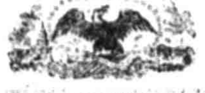
SATURDAY, DECEMBER 12, 1868.