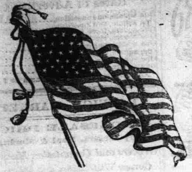
There was in the City one Sosis, infamous for his insolence and villainy, who thought the perfection of Liberty was licentiousness of Speech.—PLUTARCH.