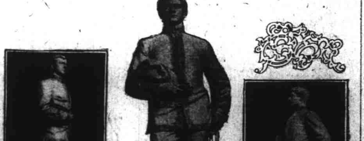
Portrait of a man, likely related to the 'Mised Getting Hurt' article.