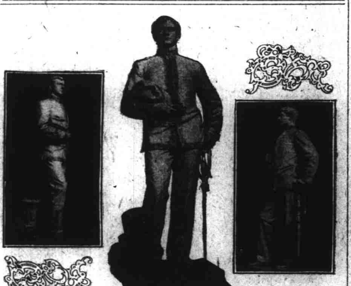
A large illustration of a man in a suit, likely related to the 'Bronze Statue of Worth Bagley' article.

(By the Associated Press.) Allahabad, British India, May 3.—Serious anti-European riots have occurred at Rawalpindi Punjab, where a Hindoo mob burned two bungalows, pillaged the mission church, looted the postoffice, burned a garage and all the motor cars in it, destroyed the plant of a power house and smashed the windows of the residences of many Europeans.