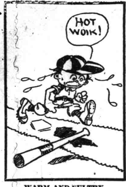
WARM AND SULTRY.

Should not the first game have been stopped two hours before sunset, as a double header was determined upon? 2. What time do the major leagues start their double headers?