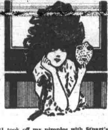
"I took off my pimples with Stuart's Calcium Waters."

All about us every day we see women who would be exquisitely beautiful were it not for the horror of pimples, blotches, and other skin eruptions.