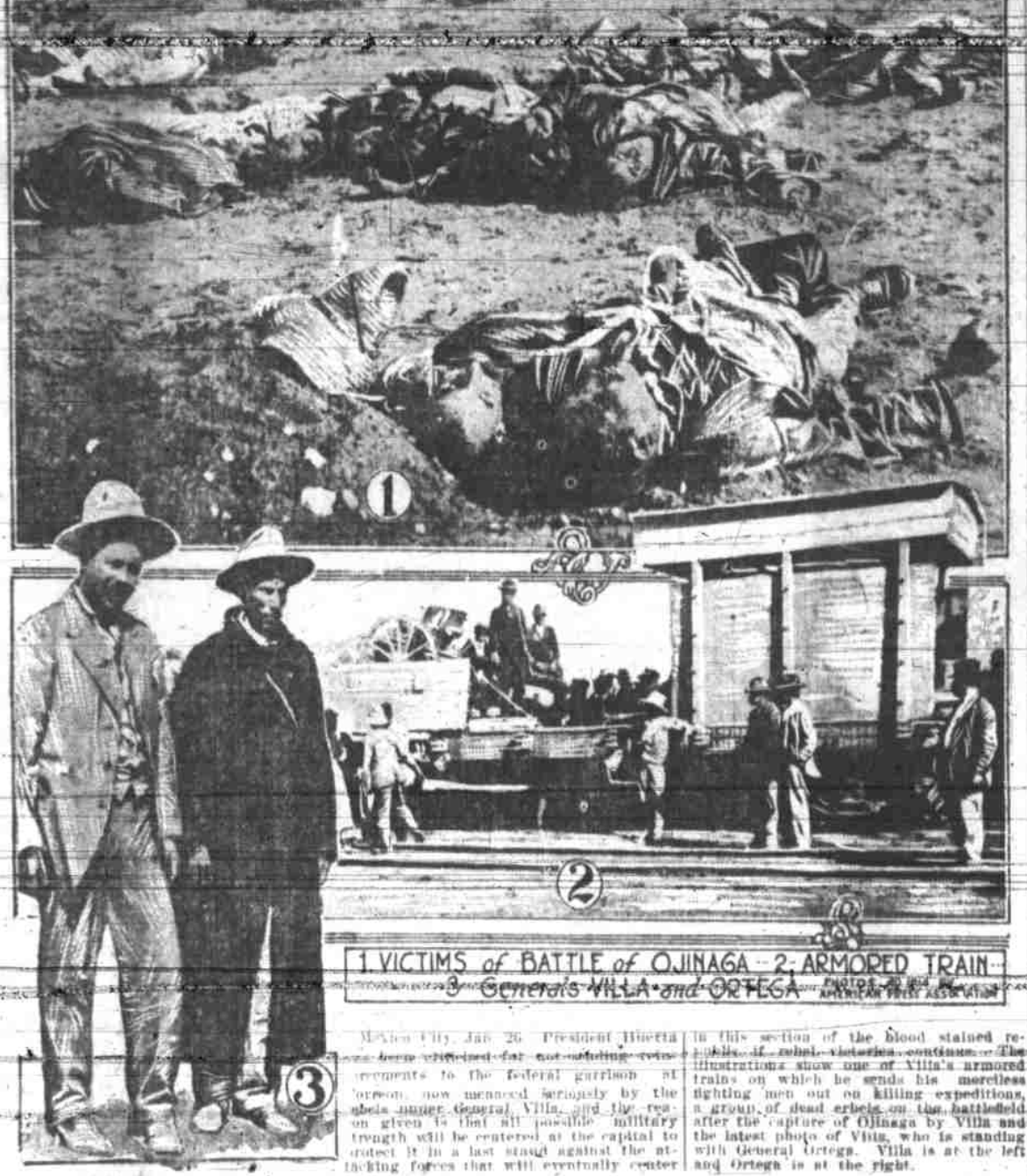
1 VICTIMS OF BATTLE OF OJINAGA. 2 ARMORED TRAIN. 3 GENERALS VILLA AND ORTEGA.