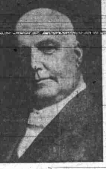
Confirmed Yesterday by the United States Attorney of the Eastern District of North Carolina.

he pegged to the bases perfectly and hit well. So Philadelphia fans at least would not be surprised to see father and son on the same baseball club before many more seasons have passed.