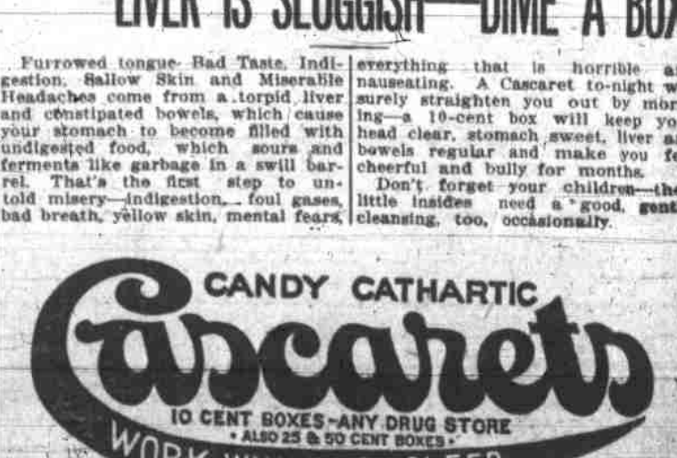
CANDY CATHARTIC 10 CENT BOXES—ANY DRUG STORE ALSO 25 & 50 CENT BOXES WORK WHILE YOU SLEEP

LIVER IS SLUGGISH—DIME A BOX. Purged tongue—Bad Taste. Indigestion. Sallow Skin and Miserable Headaches come from a torpid liver and constipated bowels, which cause your stomach to become filled with undigested food, which sours and ferments like garbage in a swill barrel. That's the first step to untold misery—indigestion, foul gases, bad breath, yellow skin, mental fears.