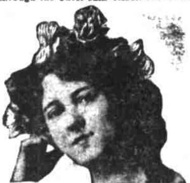
Queenly Complexion. I Know."

of nearly all poor complexions are the impurities in the blood, and which sho through the outer skin tissue. The blood