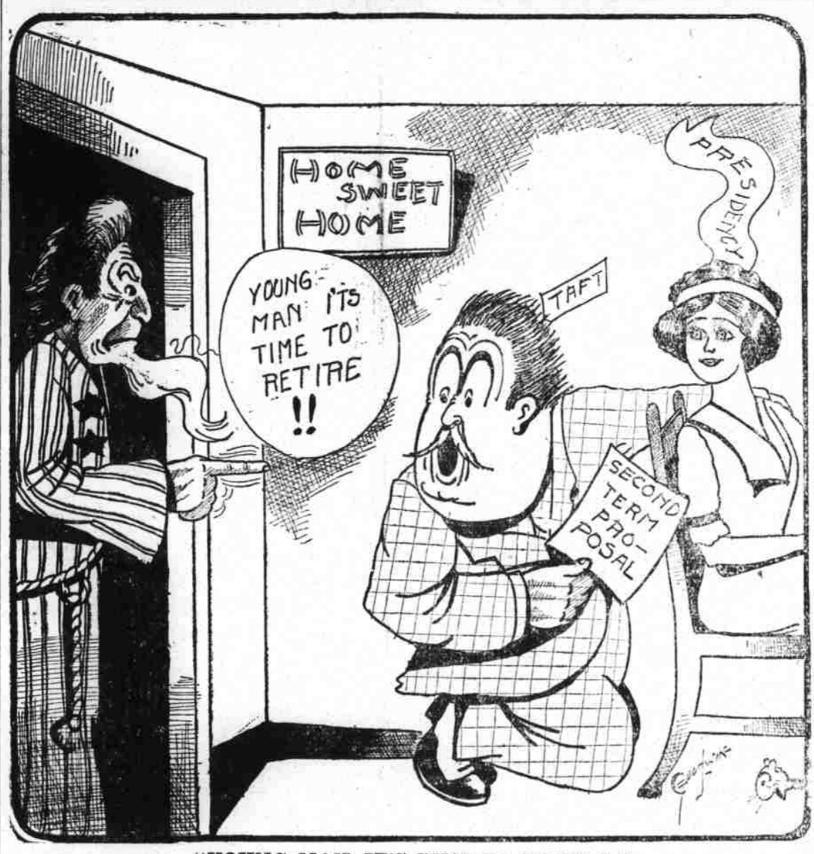
"YOUNG MAN, IT'S TIME TO RETIRE."