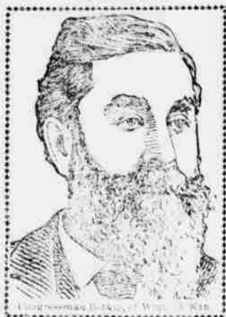
Dr. Williams' Pink Pills for Pale People

With Catarrh of the Stomach--Pe-ru-na Cured.