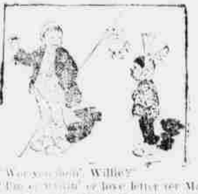
Receiving a Hint.