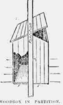
WOODBOX IN PARTITION.

The box is filled from the kitchen side, and if the boxes are kept closed when not in use, cooking odors will not penetrate the dining room.