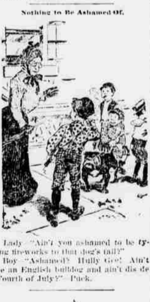
Nothing to Be Ashamed Of.