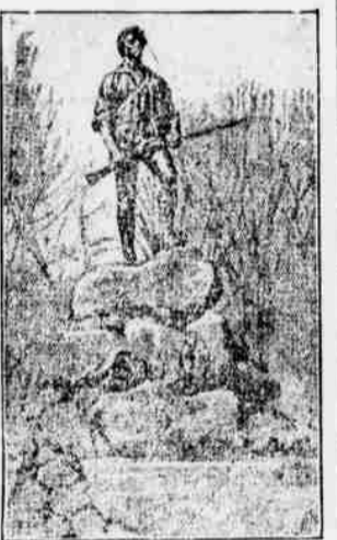
STATUE OF THE MINUTE MAN.