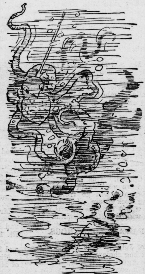
Dragged From His Boat.

Prosaic Occupation. Catching the devilfish is a prosaic occupation. In fact, the fish catch themselves. The traps, spaced to the depth of water from five to fifty fathoms, are fastened to long lines laid on the bottom. Some stretch out 10 miles into the sound, the average being three to four miles. The trap resembles a small, loosely built barrel, which is open at one end and baited with clams. After the fish has entered and devoured the clams, it generally reclines in a tightly drawn bundle to enjoy perfect digestion. Fishermen in trawls and dories row over the trapping area to haul up the snares. The devilfish remains in the secluded shelter from sheer laziness, until exposed to the air. Then there is a sudden