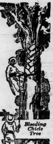
Bleeding Chicle Tree

Chicle, the base of chewing gum, is the milky juice which is secreted by the inner bark of a tropical tree known as the Achras Sapota.