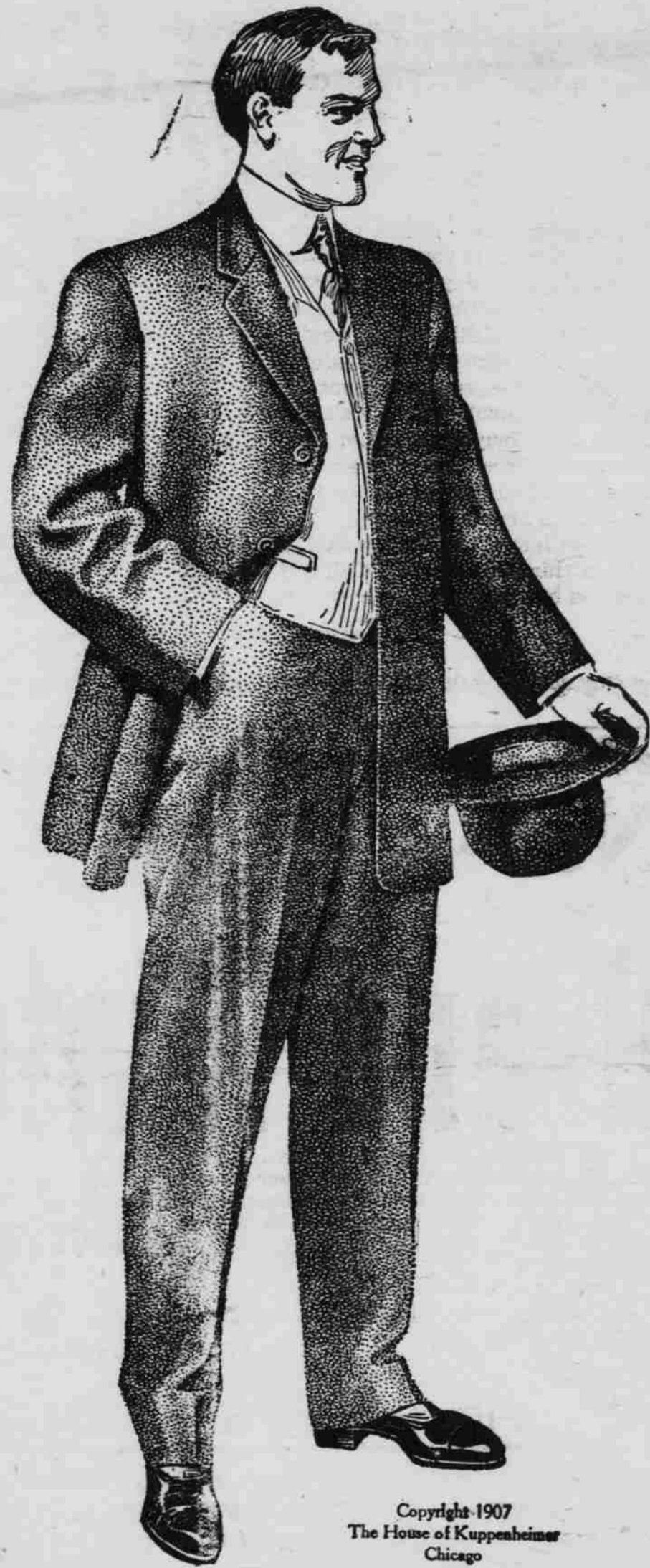
Copyright 1907 The House of Kuppenheimer Chicago