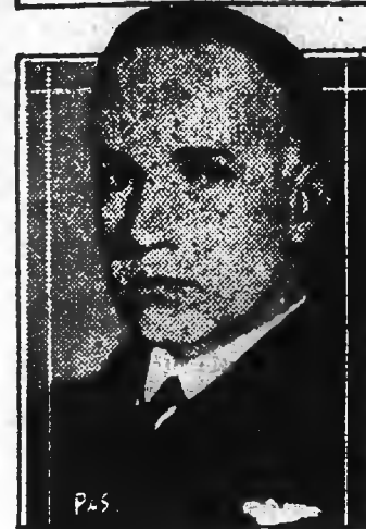
Commander John A. Towers, (above) of the U. S. Navy is expected to succeed the late Admiral Moffett, lost in the destruction of the Akron, as chief of the Naval Bureau of Aeronautics.