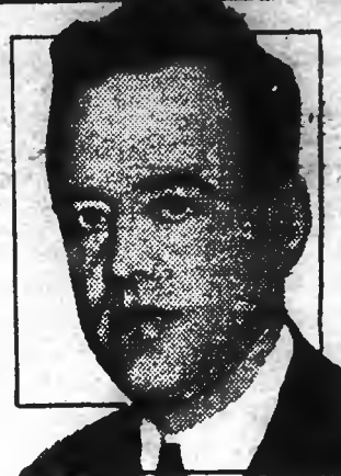
Washington . . . Thomas Jefferson Coolidge (above), Boston banker, photographed at his desk when he took over U. S. Treasury fiscal affairs as assistant to Secretary Morgenthau.