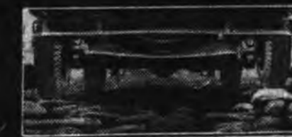
FULLY-ENCLOSED KNEE-ACTION WHEELS