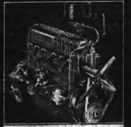
80-HORSEPOWER—80 MILES PER HOUR