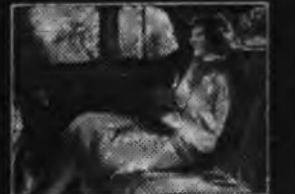
BODIES BY FISHER