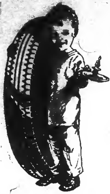
Time To Re-tire GET A FISK! TRADE MARK REG. U.S. PAT. OFF.