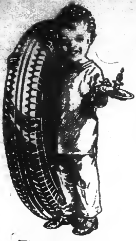
Time To Re-tire GET A FISK! TRADE MARK REG. U.S. PAT. OFF.