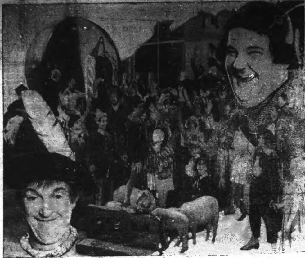
"Babes In Toyland" the picturization of Victor Herbert operetta, which is the New Years Day attraction. It is another of Laurel and Hardy's new feature length pictures which has received untold favorable criticism, that comes to the Liberty Theatre.

Three thousand baby chicks have been started for boilers in Catawba county with an equal number to be started in the next two or more succeeding weeks, reports the county agent.