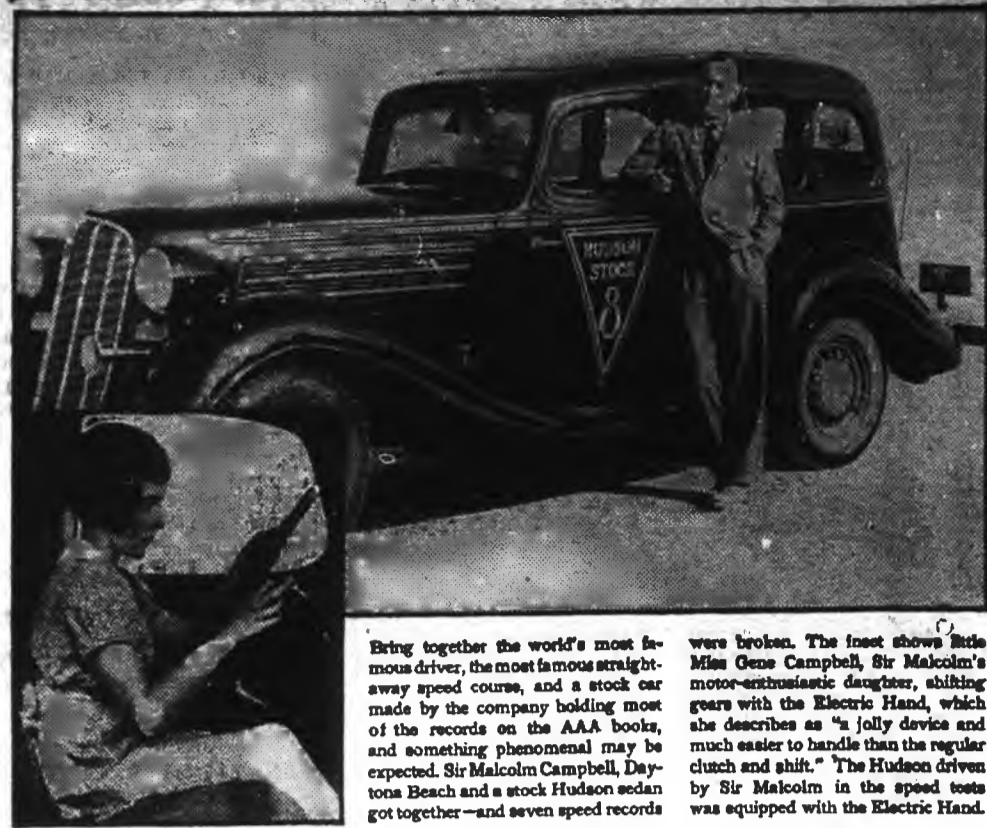
Bring together the world's most famous driver, the most famous straightaway speed course, and a stock car made by the company holding most of the records on the AAA books, and something phenomenal may be expected. Sir Malcolm Campbell, Daytona Beach and a stock Hudson sedan got together—and seven speed records