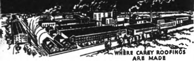
WHERE CAREY ROOFINGS ARE MADE

CAREY Roofings and Shingles are made in the largest individual roofing plant in the world. Huge production effects large savings, and these are passed along in the form of extra quality. That is why we can offer you greater values for your roofing dollar.