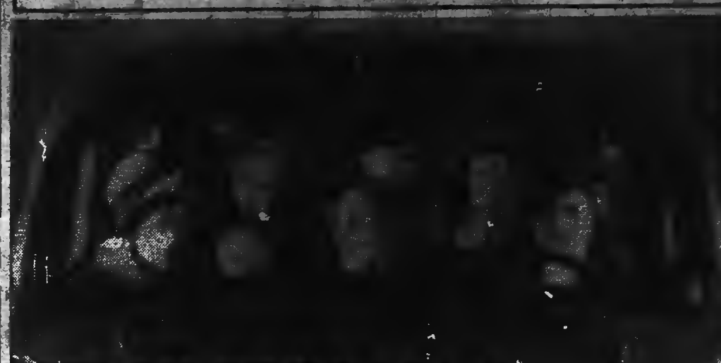
Three men try out the rear seat of the 1935 Ford V-8 Deluxe Fordor sedan and agree that "the back seat passenger gets a front seat ride." And the three women find that now the front seat is as wide and roomy as the rear seat. The "better-ride" qualities of the new car have been developed through what is virtually a revolutionary change in the seating arrangement plus an entirely new principle in "springbase" design.

"Mother has to ride in front on account of her lumbago" will soon be an old-fashioned expression as "you will have to get out and crank it, I'm afraid." At least it will be an out-of-date phrase for owners of the 1935 Ford V-8s, for the easy-riding qualities of the new car, both front and back, make everybody happy wherever they sit. The seats have been moved forward so that all passengers ride now between the axles. The rear seat is eight and a half inches further forward of its position in the former model bringing passengers closer to the center of the car and minimizing the effects of bumps in driving over uneven roads. In conjunction with this change, softer, longer springs have been