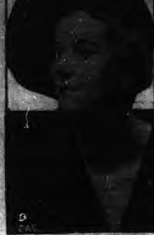
NEW YORK. Above is pictured an authentic tip-off of the trend in women's fall hats. It is the velvet beret, glorified with a forward movement and emphasized by clever fan-like inverted tocks. The simple band, knotted on the left, is of black belting ribbon.