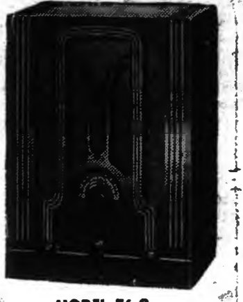
MODEL T6-9 For only the low price shown above, you can enjoy foreign radio programs—police alarms—domestic broadcasts—as RCA Metal Tubes, Automatic Volume Control and other fine features produce them.

Stop wishing you could buy a new radio. Buy one! You can now, far more cheaply than you thought. A good one, too—an RCA VICTOR with the revolutionary RCA Metal Tubes! Here are three to choose from, priced even lower than many a less modern, less satisfying instrument.