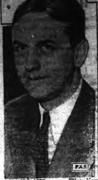
ELLIOT NES (above), 32, is a former "G-man" who "broke" the Al Capone beer racket a few years ago. Today he is the new safety director here, in charge of Cleveland's police and fire departments, the youngest man ever to hold the job.