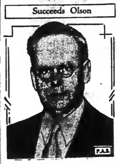
Succeeds Olson St. Paul, Minn., Sept. 13.—Above is Governor Hjalmar Peterson of Minnesota, who succeeded the late Gov. Floyd B. Olson, who died during late August. Governor Peterson, Danish immigrant and country editor, was Lieutenant-Governor under Olson.