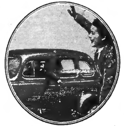
PERFECTED HYDRAULIC BRAKES

FOR ECONOMICAL TRANSPORTATION CHEVROLET , A GENERAL MOTORS VALUE