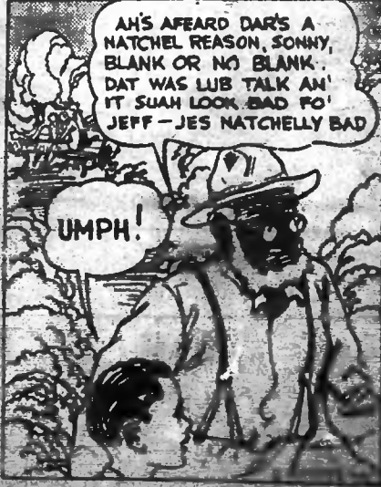
(Uncle Natchel and Sonny are on your radio twice each week. See listings of leading southern stations.)