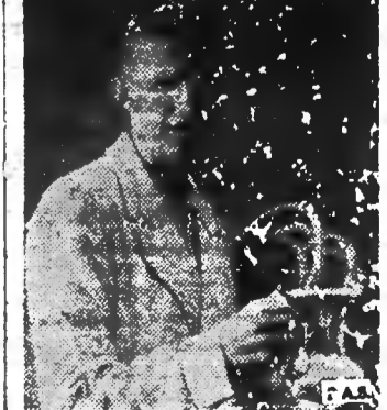
World's Tennis Champ Forest Hills, L. I. . . Donald Budge, (Oakland, Cal., winner of the Wimbledon singles, doubles and mixed doubles titles, added the U. S. National title to his list by defeating Von Cramm of Germany in a hard fought match.

With the exception of Elkin, Taylorsville and Wilkesboro all opponents are members of the conference.