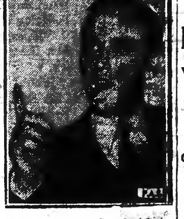
Washington, D. C. . . . Administration officials announce that with a speedy Congressional okay they will be able to pour an estimated four billion dollars into the dry economic pump before the end of May. Plans call for relaxation of RFC lending restrictions, new public works, more pensions and insurance benefits and loans to cities and states. Most of the money will be spent by Harry Hopkins, relief czar (above), who asked for an end to "direct relief."