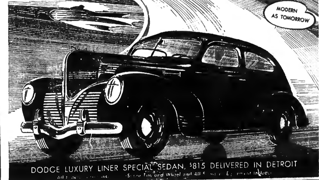
DODGE LUXURY LINER SPECIAL SEDAN, $815 DELIVERED IN DETROIT

Decide For Yourself! It takes a heap of good looks for any car to stand out in today's sparkling style parade! Frankly, we think Dodge does. But we're not going to insist. Instead we'll leave it to you! "Take a Look... that's all Dodge asks!" And after you've feasted your eyes on its windstreamed beauty, its gorgeous interior, its "Jewel Case" instrument panel, take a look at the many new engineering ideas that make this the greatest car Dodge ever built! And then take a look at the price tag! You'll be surprised—because Dodge prices are as much as $55 less than last year!