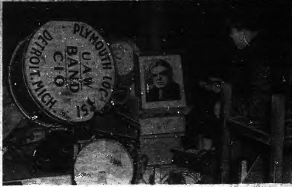
Formerly under guard in a Detroit warehouse, the records and equipment of Plymouth Local No. 51 are a pawn in the coming C. I. O. conventions. A circuit court judge granted Homer Martin's forces custody of the equipment pending the outcome of a replevin suit. The Martin convention will be held in Detroit early in March, while the Lewis forces will gather in Cleveland late the same month.