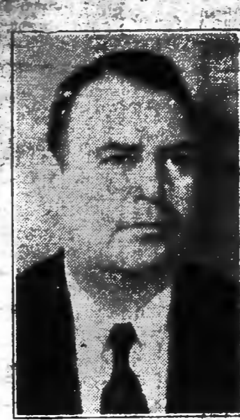
Mayor R. T. McNeil, who with all the board of commissioners announced today candidacy for re-election in the city election to be held May 2.