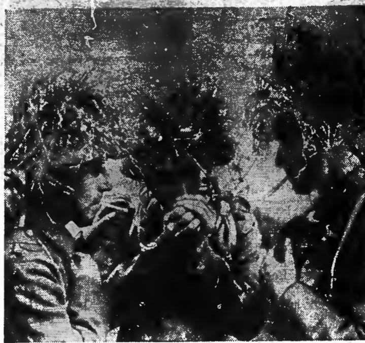
With camouflaging weeds fastened on their steel helmets to fool enemy airmen, three Tommyes of the East Surrey British regiment pause to light their cigarettes. Natural and artificial camouflages have been developed to a high degree by both sides of the present conflict.