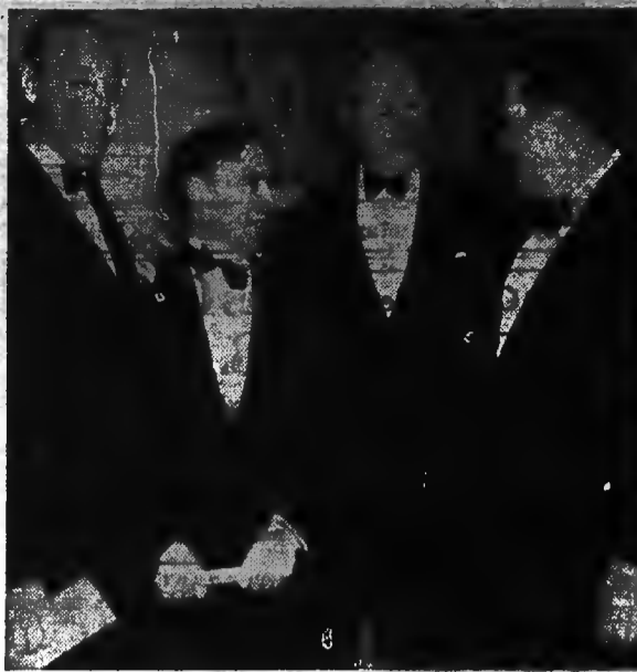
A quartet of distinguished guests pictured during inner circle dinner of city hall reporters and political writers in New York city. Each one a presidential possibility, they are, left to right: Sen. Robert Taft of Ohio, Rep. Joe Martin of Massachusetts, Postmaster General James A. Farley, and Wendell Willkie. Taft, Martin and Willkie are Republicans; Farley a Democrat.