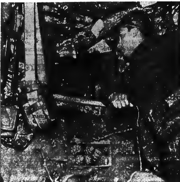
Somewhere on France's Lorraine front a French soldier keeps eternal vigilance behind his rifle-machine gun, lest a German surprise attack be successful. Note the cache of hand grenades just below the gun. They are used for close-in fighting.