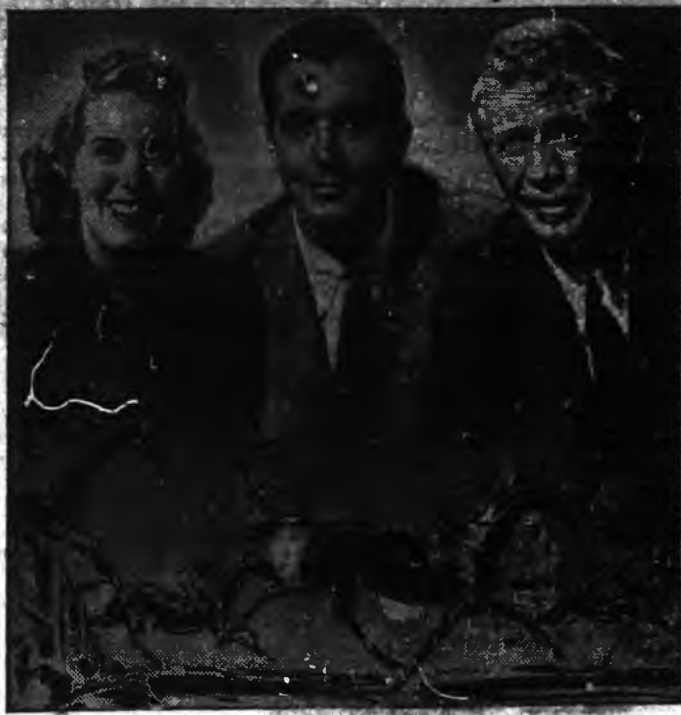
Brenda Joyce, John Payne and Walter Brennan, shown above, share the leading roles in "Maryland", which is showing at the Orpheum today and Friday.