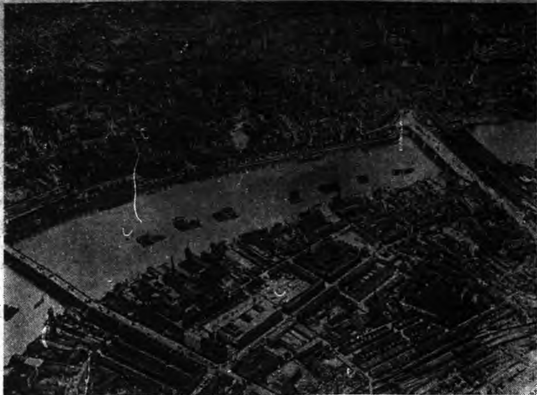
Here is an aerial view of a section of London's waterfront as it appears to the bombardier of a raiding plane. In the foreground are some of the piers and warehouses that stretch for miles along the Thames; across the river, magnificent public buildings and residential estates. London, heart of England, and nerve center of the British empire, has been in a continual state of alarm recently, as Hitler's air armadas swoop in from across the channel. The Thames is a silver signpost that leads air raiders right to the front door.