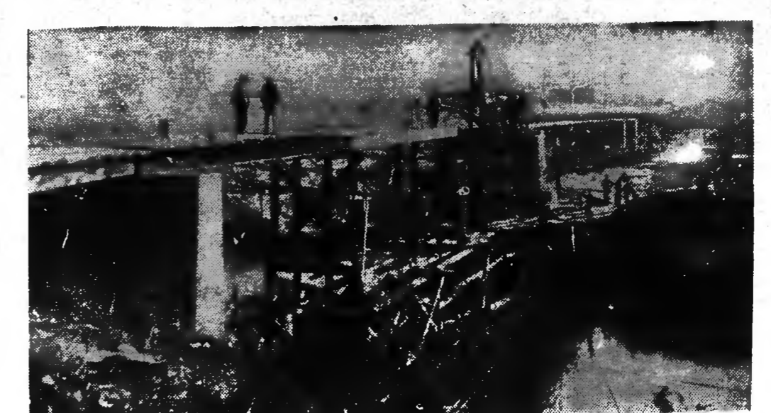
This picture was taken just before state highway forces completed a temporary bridge across the Yadkin at the lower bridge site here the latter part of the week. The structure accommodates one-way traffic and has a load limit of eight tons. Bridge forces put up the bridge rapidly on