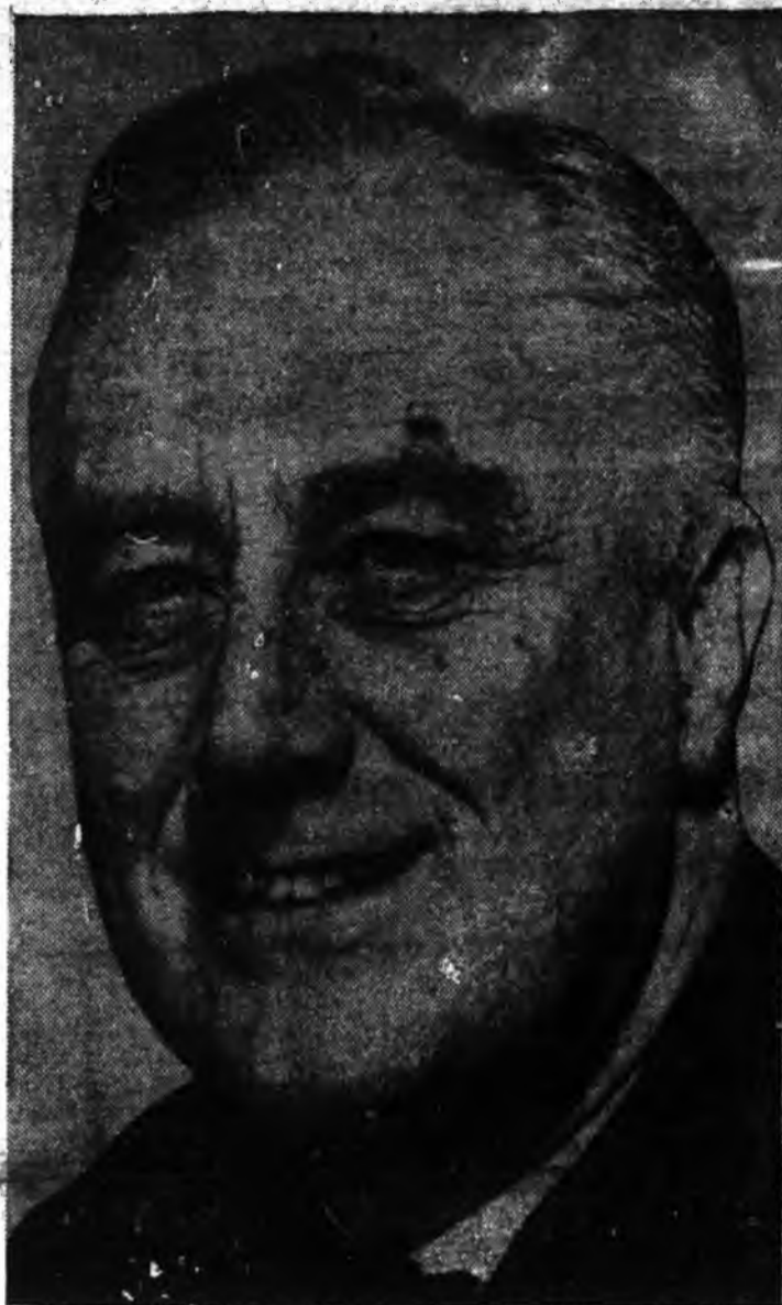
PRESIDENT FRANKLIN DELANO ROOSEVELT