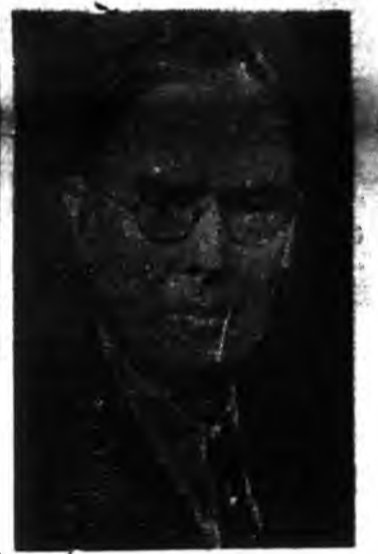
Representative W. O. Burgin, who on Tuesday was elected to his second term in congress from the Eighth district.