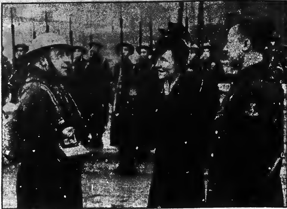
Crown Princess Juliana of the Netherlands shown talking with one of the officers of the Dutch troops training in Canada to join the fight with the other Allied nations still continuing their struggle for freedom. At right is Lieut.-Col. C. J. Sas, Commandant of the Training Center, who is escorting Princess Juliana during the inspection. In the background Dutch troops present arms.