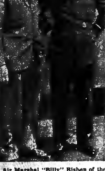
Air Marshal "Billy" Bishop of the Royal Canadian air force (right) inspects the huge Douglas aircraft plant at Santa Monica, Calif., where many planes for the RAF are made.