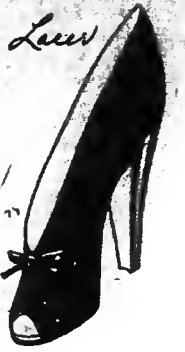
Black suede open toe low pump as illustrated . . . $7.75

One of America's foremost line of quality footwear, "Rhythm Step" joins our already long list of famous exclusive lines—And now in August we invite you to come and see the stunning new fall creations . . . And you will be as thrilled as we are over this timely addition to our family . . . All Spainhour footwear expertly and correctly fitted, because we carry all sizes and widths.