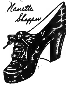
Four eye tie in tobacco tan alligator, walking heel . . . $7.75