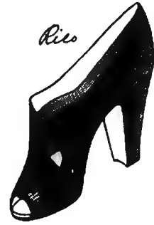
Black or brown suede with ribbon piping, open toe as shown . . . $7.75

Exclusive in North Wilkesboro at Spainhour's