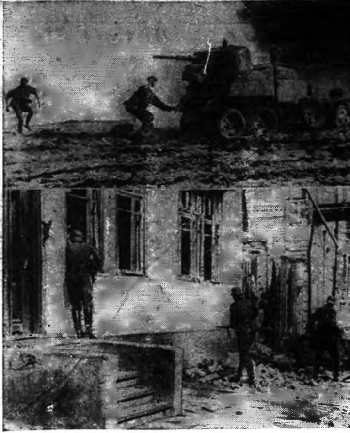
Bodies are taut as the German soldiers advance toward the Russian tank (top picture) after it was stopped by the first salvo. Soldier in center holds a hand grenade which he is about to hurl. Below: Three German infantrymen look cautiously into windows and behind fences as they search for snipers in a newly captured city somewhere in Russia.