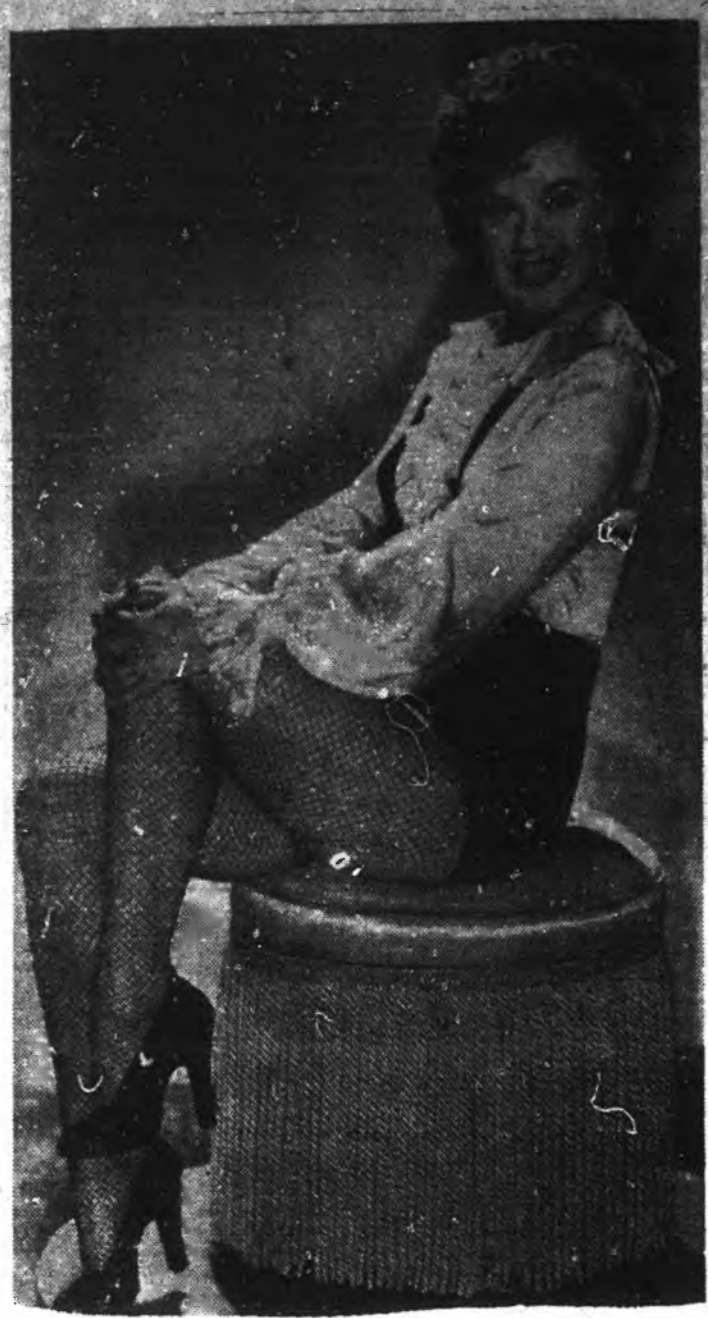
SPICED with Ginger Rogers, "Roxie Hart" comes to the screen as a good little girl who could do no wrong—but how she tries! Ginger is starred in the hilarious new 20th Century-Fox hit at the Allen Theatre Thursday and Friday.