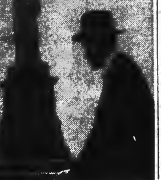
Lord Halifax, British ambassador to the U. S., pays his first visit to the Statue of Liberty. Here he gazes at the symbol of freedom from the boat that took him to Bedloe's Island.

Election Of Chairman and Secretary Deferred Until Call Meeting Committee